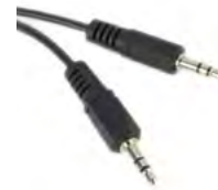
3.5mm jack cable