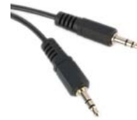
3.5mm jack cable