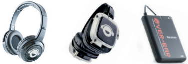
HARRY JOE NED

Your Parakeet is compatible with a range of OVER-EAR products. Feel free to mix and match different headphones and receivers (such as Harry and Ned), and combine different transmitters (like Falcon) to create your ideal system.