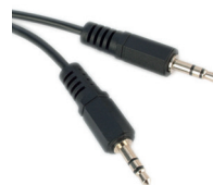
3.5mm jack cable